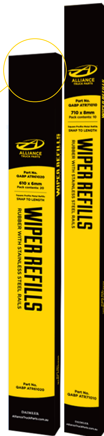
Illustration and photographs used in this catalogue may vary slightly from the actual product. Prototype samples are sometimes for photography. The production parts may vary slightly. Availability of products shown in this catalogue is subject to change without notice. Alliance Truck Parts is a registered trademark of Daimler Trucks North America LLC.